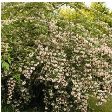
2.5m High / 2.5m spread Flowers Jun-Sep

Note: we may also include a few different varieties of Dogwood