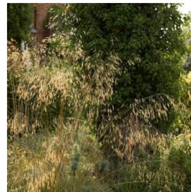
Ornamental grasses (Image - Stipa gigantea )

PM Turf is 100% floriferous material, meaning no grasses are added to the mix. This is because grasses quickly out-compete other plant-life, damaging the overall effect of the meadow and reducing its lifespan. PM turf meadows attract as much wildlife as possible so there are plants in the mixes which will flower right through to the first frosts, and species whose seed heads provide valuable winter feed for birds.