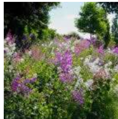
Woodland Meadow Mix

Note: We may also include different selections of Euphorbia