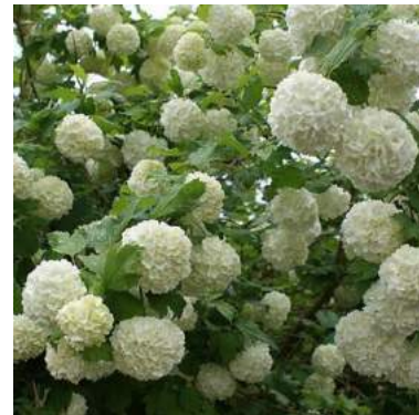
3m High / 3m spread Attracts bees/butterflies Flowers May-Jun