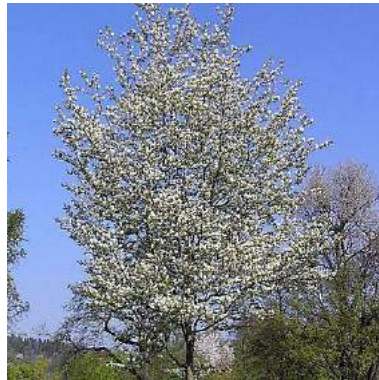
Seasonal interest Bee Friendly Flowering tree 5-7m high

This tree has pretty single pink flowers that appear early in the spring and remain on the tree whilst the dark foliage begins to emerge, gradually fading to white and contrasting fantastically with the dark leaves. The leaves are small and very dark purple and unlike many purple leaved trees the leaves remain dark throughout the entire season, until turning a brighter red in the autumn time before falling.