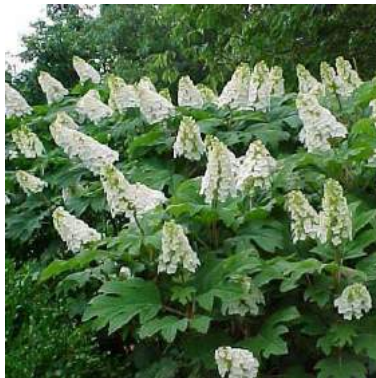
2m High / 2m spread Flowers Jul-Sep

2m High / 1.5m spread Attracts bees/butterflies Flowers April – May