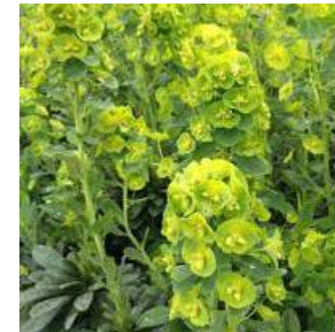
0.7m high by 1m spread Flowers Apr - Jun

Domed clusters of fragrant white flowers in April and May, opening from pink buds, followed by red fruit, and glossy, dark green leaves. This Viburnum is one of the best scented varieties and is usually evergreen when the plant matures. To fully appreciate the fabulously fragrant flowers chose a partly shady border close to an entrance or path.