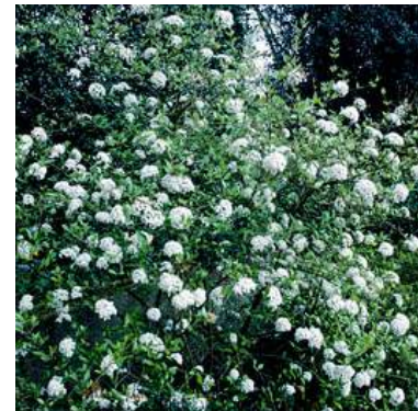
2.5m High / 2.5m spread Flowers Apr-May

In May and June the branches of this vigorous deciduous shrub are smothered with large, snowball-like clusters of white or green-tinted white flowers - which sometimes age to pink. With maple-like, fresh green leaves that become purple-tinted in autumn it's an excellent ornamental plant for a sunny shrub or mixed border with fertile, moist, well-drained soil