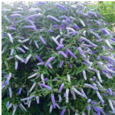
Hebe 'Midsummer Beauty' Shrubby Veronica 'Midsummer Beauty' is a medium-sized evergreen shrub to 2m in height, rounded in habit, with long narrow leaves tinged purple when young. Small lilac-mauve flowers, fading to white, are borne in racemes to 15cm in length in summer and autumn

2m High / 1.5m spread Attracts bees/butterflies Flowers April – May