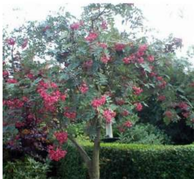
Seasonal interest Bee Friendly Berries 3-8m high

Like the species, the most notable feature of this tree is the curious large, green-yellow tulip shaped flowers produced in June and July and unlike its parent this tree tends to produce flowers at an early age