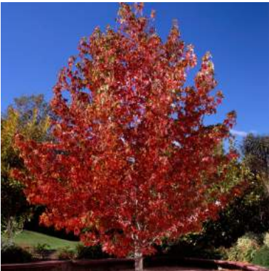
Seasonal interest Autumn colour 12-17m high

A very good choice for streets gardens and parks