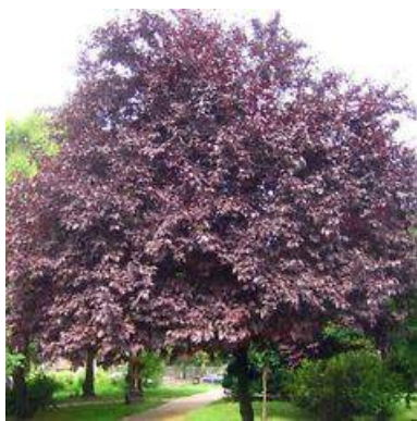
Seasonal interest Bee Friendly Flowering tree 7-12m high