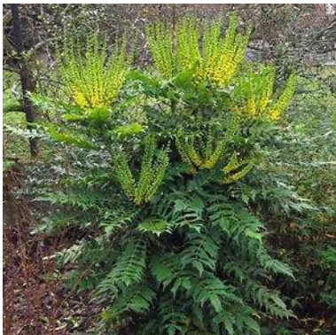
3m High / 3m spread Flowers Nov-Mar

Note: we also include other varieties of Hydrangea