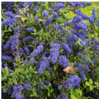
Ceanothus 'Italian Skies' California Lilac 'Italian Skies' is a spreading medium-sized evergreen shrub with small, glossy dark green leaves and small bright blue flowers in compact conical clusters in late spring

1.5m High / 2m spread Attracts bees/butterflies Flowers April – May