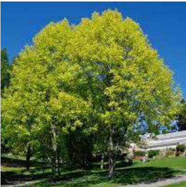
Seasonal interest Bee Friendly Good urban tree 12-17m high

Juneberry trees have the significant benefit of providing some interest at all points of the year; starting in spring, the profuse white flowers emerge in plentiful racemes (flower clusters along a central stem), covering the Amelanchier from top to bottom. The foliage follows the blossom, emerging a coppery colour which turns to bright green by late spring. The fantastic rich red autumn colour concludes this trees remarkable display.