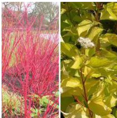
3m High / 3m spread Winter colour

1.5m High / 2m spread Attracts bees/butterflies Flowers April – May