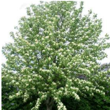
Seasonal interest Bee Friendly Flowering tree with berries 7-10m high

Splendid white berries start out pink before turning white they are produced in large clusters with stunning red autumn colour. These characteristics typifies Sorbus hupehensis as a small low maintenance tree which thrives on most soils and can tolerate the rigours of the urban environment