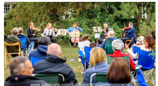
The audience brought their own chairs

Everything was organised in line with Covid regulations, which meant we couldn't publicise it very widely (sorry if you missed out!) or have extras like cream teas or stalls.